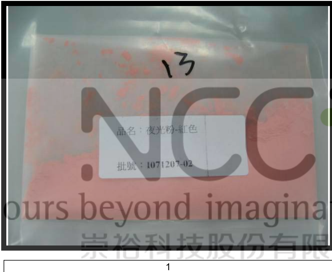
Photo of the Submitted Sample

Lab No. : (6208)085-0236 Date : March 28, 2008 Page : 4 of 6