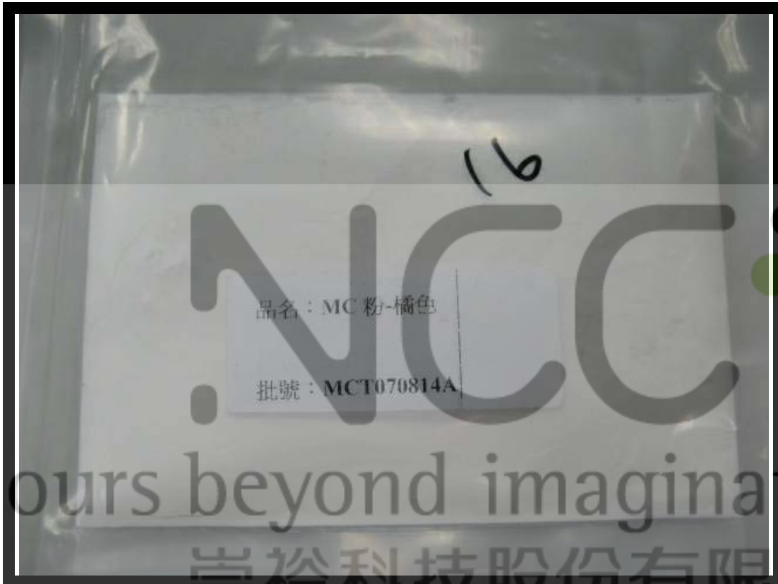
Photo of the Submitted Sample

Lab No. : (6208)085-0239 Date : March 28, 2008 Page : 4 of 6